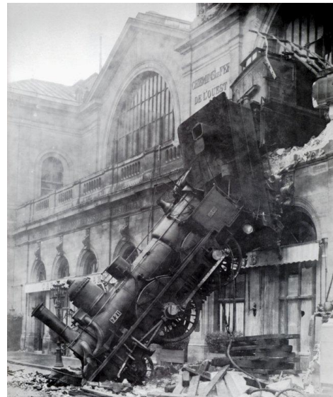
32-bit ASNs in a 16-bit Field